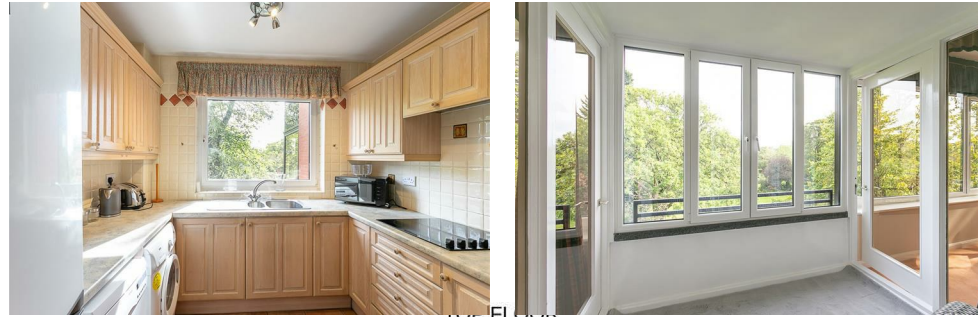
TOP FLOOR 791 sq.ft. (73.5 sq.m.) approx.

Two Bedroom Apartment | Purpose Built Block | 791 Sq. ft (73.5 m 2 ) | Allocated Off Street Parking | Fitted Kitchen | Bathroom WC | Separate WC | Lounge/ Diner | Enclosed Balcony | Open Aspect Views | Excellent Location | Electric Under Floor Heating | DG | No Onward Chain | Leasehold - 950 Years Remaining | Service Charge £ 2,520 Per Annum | Ground Rent £35 Per Annum | Council Tax Band: D | EPC Rating: C